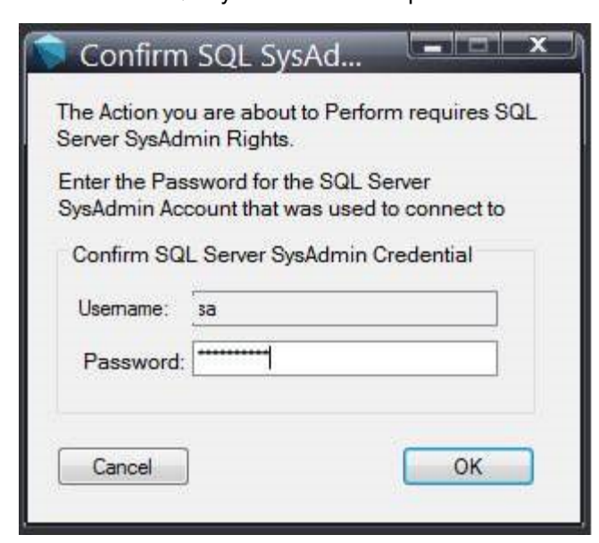
Figure 2. Confirm SQL SysAdmin screen